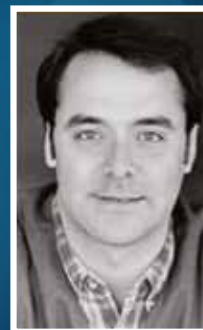
Alex Fleuriau Chateau

A BIG BAND COMMUNITY CHRISTMAS Sat Dec 15 - 7:30 pm, $23.50 + HST