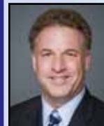
Gord Brown Member of Parliament Leeds-Grenville

As the Member of Parliament for Leeds-Grenville it gives me a great deal of pleasure to support the Arts Centre program in Brockville.