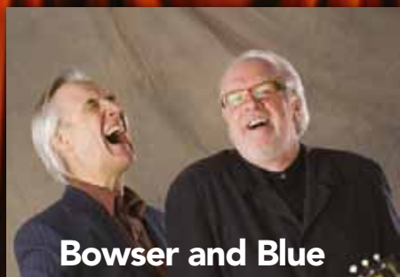
Bowser and Blue